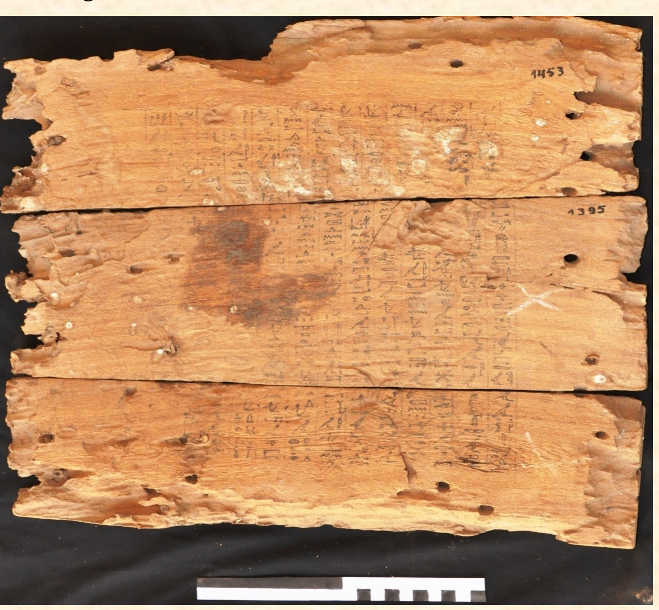
Fig.3 Lid of the coffin of Osiris Pa ccn from Tuna El-Gebel subterranean galleries, stored in Al-Ashmunien magazine.

According to god Osiris Pa ccn, he represented in scenes from Ptolemaic period in human body with a baboon head and there is the crescent moon shape above his head. He is a shape of the god Thot