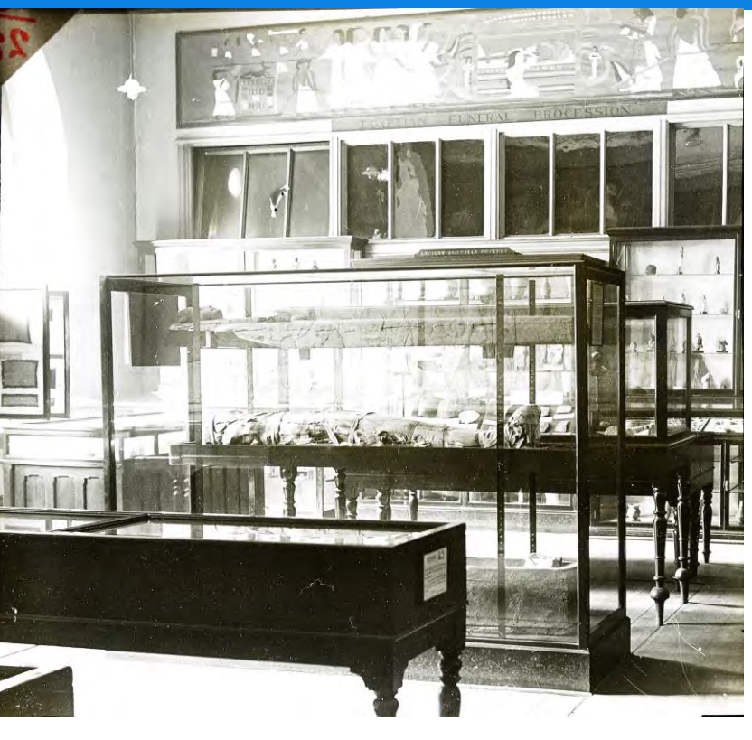
Magic lantern slide of the Egyptian Room c.1914

Dundee was a prosperous Royal Burgh and a busy port from medieval times until the 20<sup>th</sup> century. In the nineteenth century Dundee became a centre for the jute industry. The wealthy owners of the textile factories travelled the world for business and pleasure and used some of their wealth to improve the cultural life of Dundee and its citizens.